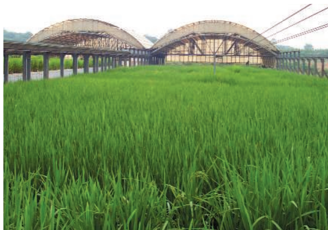
Rain or shine. In China, movable shelters shield drought-tolerant rice from rain during field trials.

Plants have mechanisms to cope with drought. In some places, local crop varieties have evolved to survive, if not thrive, as long as water shortages are not too severe. How efficiently a plant draws water from the soil, how