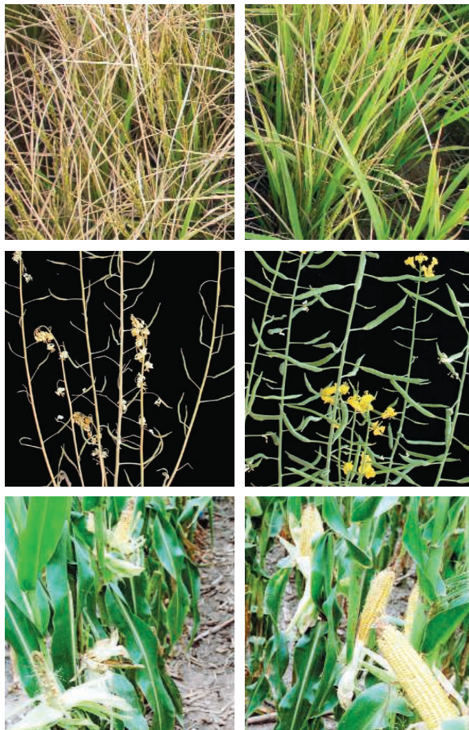
More crop per drop. Tests of genetically modified rice ( top right ), canola ( middle right ), and corn ( bottom right ) show that they withstand dry spells better than unmodified controls ( left ).

Encouraged by this discovery, McCourt and Huang, of Performance Plants Inc. in Kingston, Canada, fiddled with this same gene in canola. They created a line of canola that carried anti-sense DNA that disables the